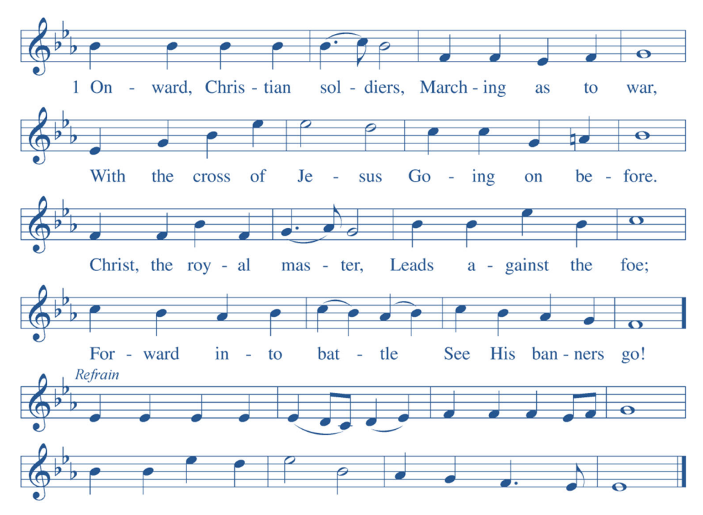
Text and Music: Public domain